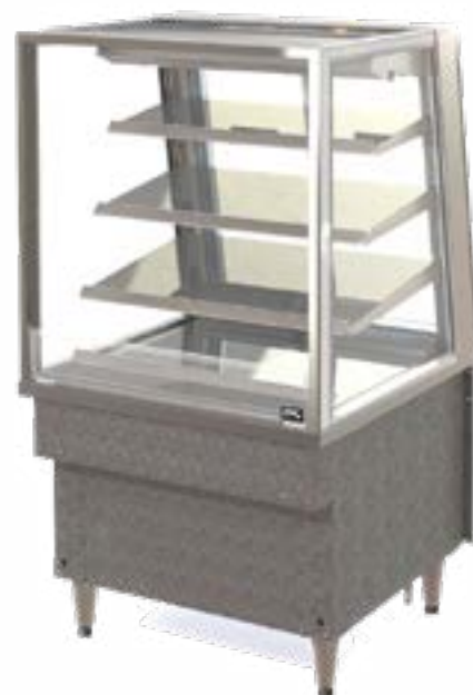
Showing : Inline 5000 Series refrigerated 800mm square freestanding open front with integral refrigeration