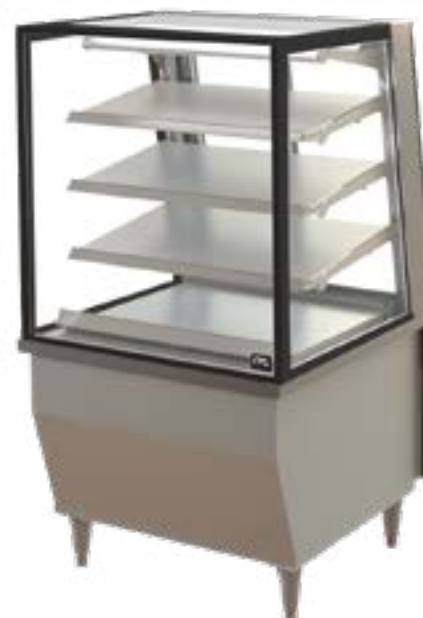
Showing : Inline 5000 Series refrigerated 800mm square freestanding fixed front with integral refrigeration