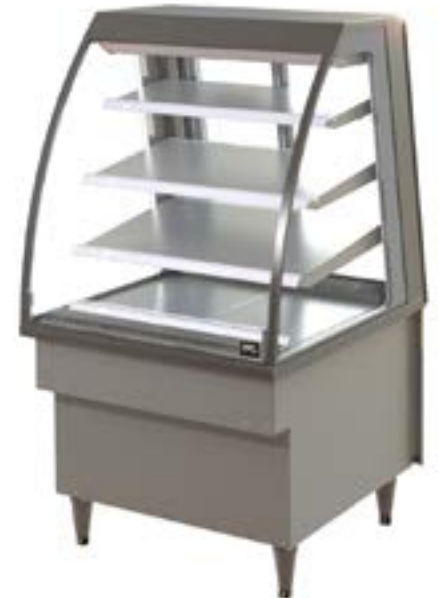
Showing : Inline 5000 Series refrigerated 800mm curved freestanding open front with integral refrigeration