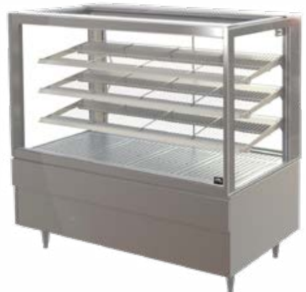
Showing : Inline 4000 Series heated 1500mm square freestanding with fixed front