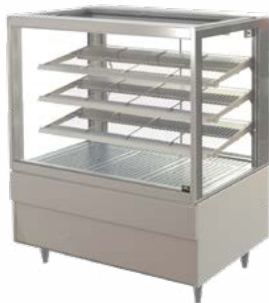
Showing : Inline 4000 Series heated 1200mm square freestanding with fixed front