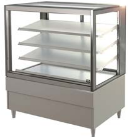
Showing : Inline 4000 Series controlled ambient 1200mm square freestanding fixed front with integral refrigeration