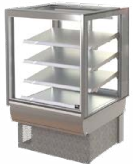
Showing : Inline 4000 Series controlled ambient 800mm square in-counter fixed front with integral refrigeration