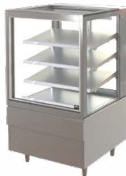
Showing : Inline 4000 Series controlled ambient 800mm square freestanding fixed front with integral refrigeration