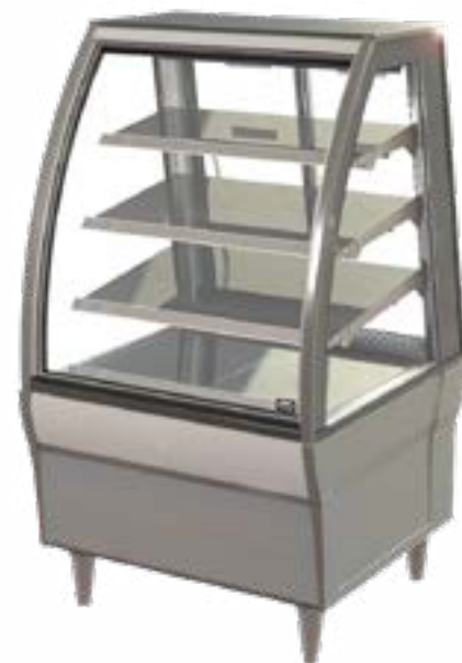
Showing : Inline 4000 Series refrigerated 800mm curved freestanding fixed front with integral refrigeration