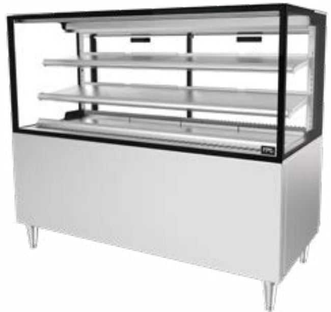
Showing : Inline 3000 Series refrigerated 1500mm square freestanding fixed front with integral refrigeration