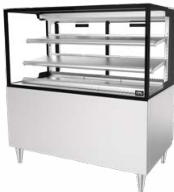
Showing : Inline 3000 Series refrigerated 1200mm square freestanding fixed front with integral refrigeration