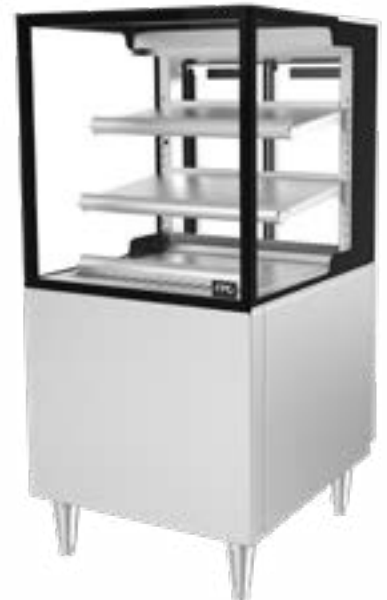
Showing : Inline 3000 Series refrigerated 600mm square freestanding fixed front with integral refrigeration