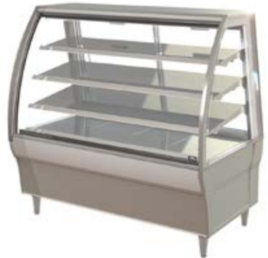
Showing : Inline 4000 Series controlled ambient 1500mm curved freestanding fixed front with integral refrigeration