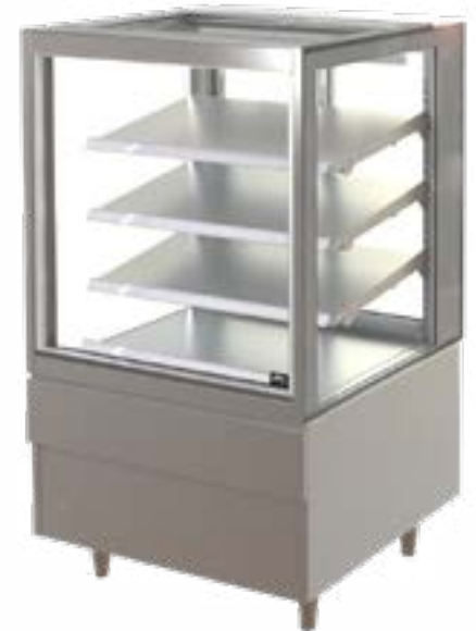
Showing : Inline 4000 Series refrigerated 800mm square freestanding fixed front with integral refrigeration