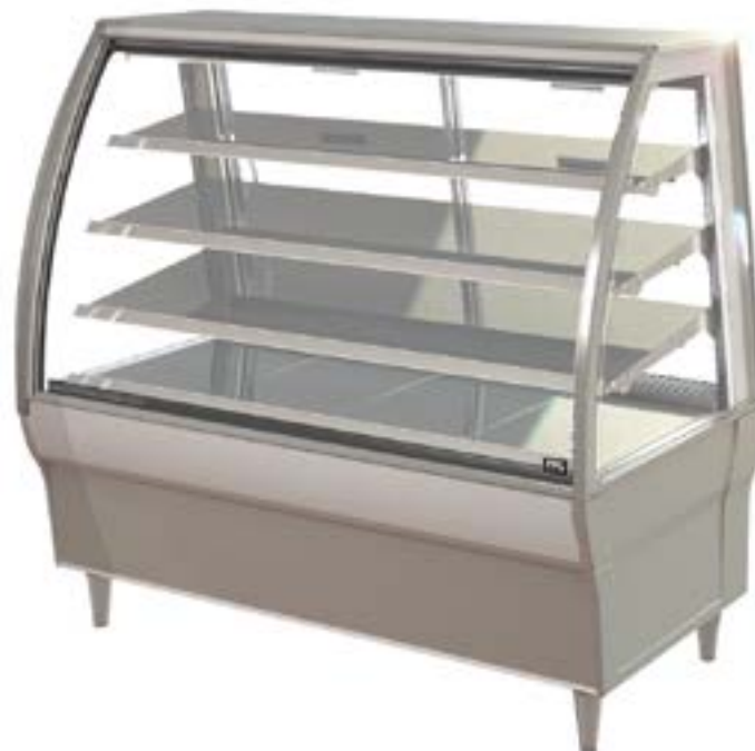
Showing : Inline 4000 Series ambient 1500mm curved freestanding fixed front