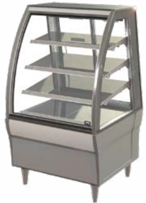
Showing : Inline 4000 Series ambient 800mm curved freestanding fixed front