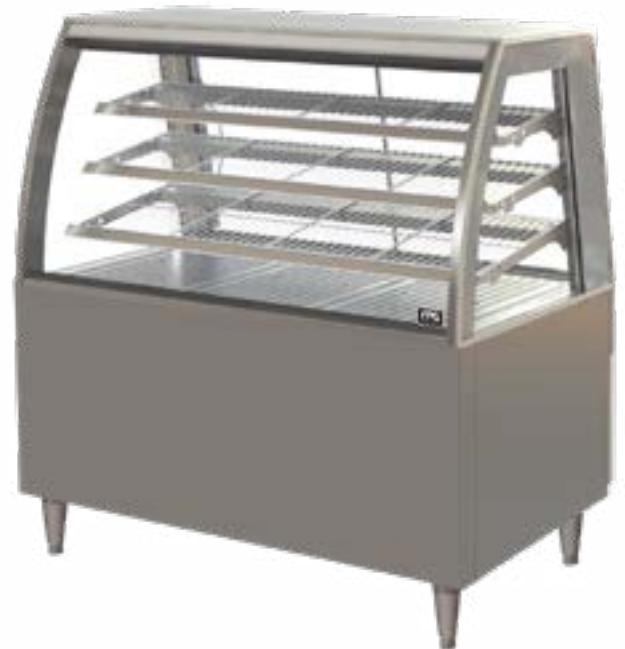
Showing : Inline 3000 Series heated 1200mm curved freestanding fixed front