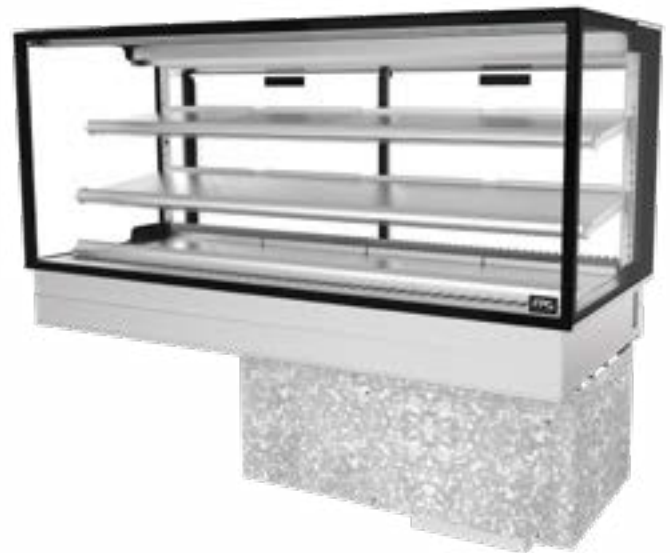
Showing : Inline 3000 Series controlled ambient 1500mm square in-counter fixed front with integral refrigeration