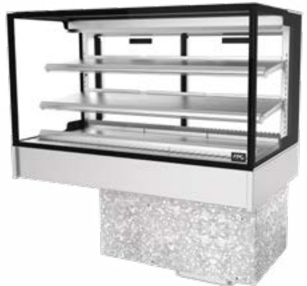
Showing : Inline 3000 Series controlled ambient 1200mm square on-counter fixed front with integral refrigeration