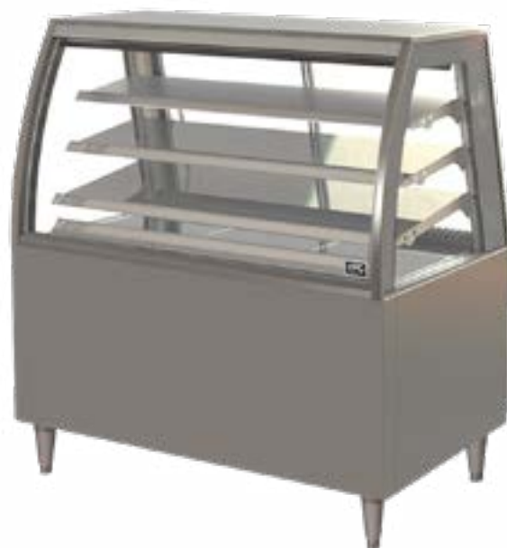
Showing : Inline 3000 Series controlled ambient 1200mm curved freestanding fixed front with integral refrigeration