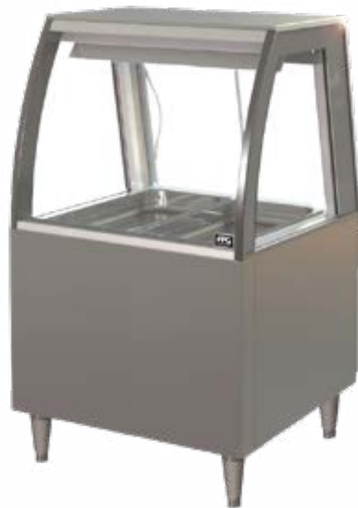
Showing : Inline 3000 Series Bain Marie heated 800mm curved freestanding fixed front