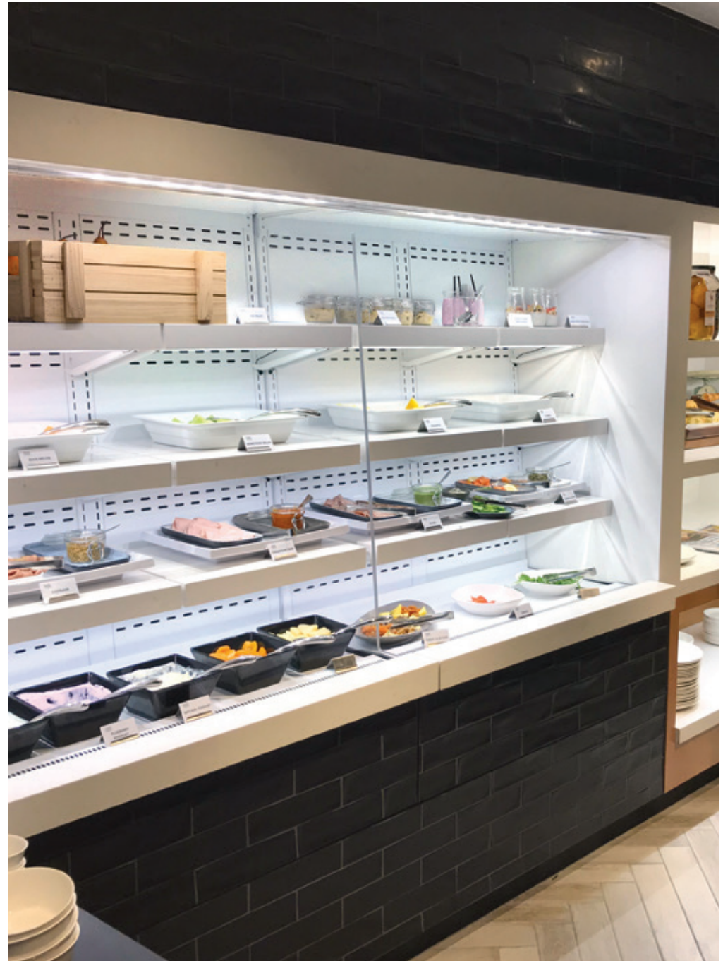
FOUR POINTS BY SHERATON, AUCKLAND - VISAIR UPRIGHT REFRIGERATED 2000

This flexibility enables you to update your display as your merchandise changes.