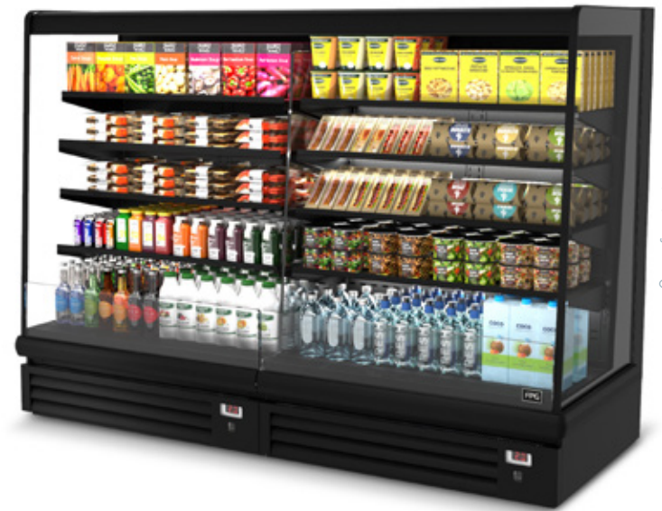
Open front with 4 shelf levels + base

Ideal for merchandising high volume refrigerated products, or bulkier products such as ready-made meals and milk.