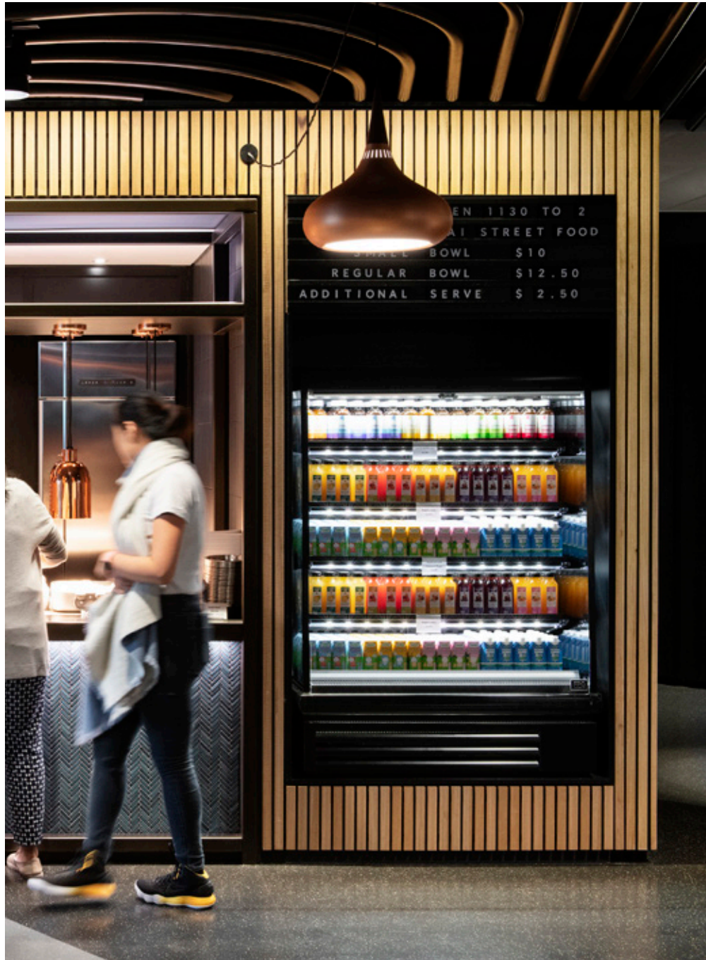
CBA, SYDNEY - VISAIR UPRIGHT REFRIGERATED 1000