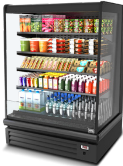
Open front with 4 shelf levels + base

Ideal for high-impact gondola ends - think sushi and wraps, drinks, dairy, deli, and seafood.