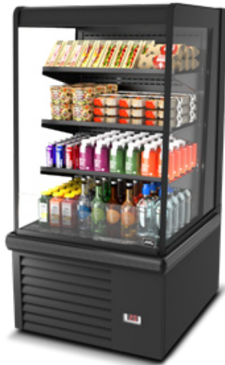
Open front with 3 shelf levels + base