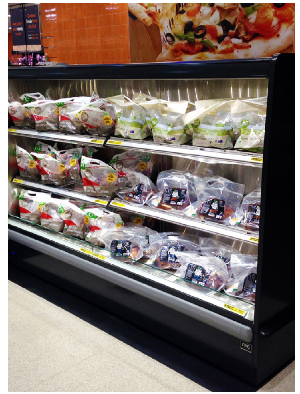
WOOLWORTHS SUPERMARKET, GREYSTANES, SYDNEY, AUSTRALIA - VISAIR UPRIGHT HEATED 2000

In the Visair heated cabinets, pluggable LED lighting is located at the top of the cabinet and at each shelf level. The plug-in feature enables the LED lighting to be replaced without the need for an electrician. With a lifetime of 25,000 hours, it will not need to be replaced very often!