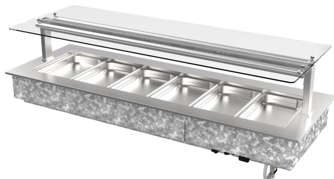
Showing : Inline GN Series heated in-counter 6x 1/1 pans, fitted with flat self-serve gantry (option) and GN pans (accessories)