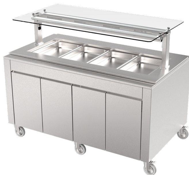
Showing : Inline GN Series Mobile heated 4x 1/1 pans, fitted with flat self-serve gantry (option) and GN pans (accessories)