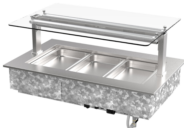
Showing : Inline GN Series heated in-counter 3x 1/1 pans, fitted with flat self-serve gantry (option) and GN pans (accessories)