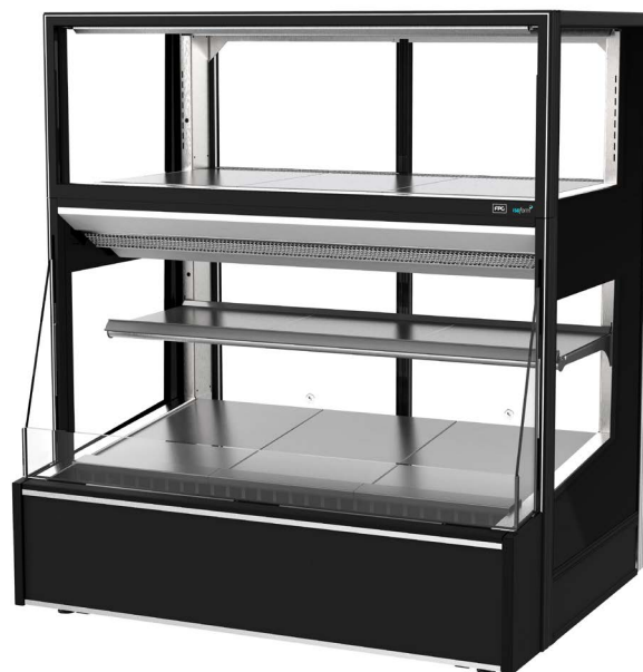
Showing : Isoform Grab&Go 1208mm width x 1354mm height Top Display: Refrigerated, tilt front. Bottom Display: Refrigerated, open front with shelf