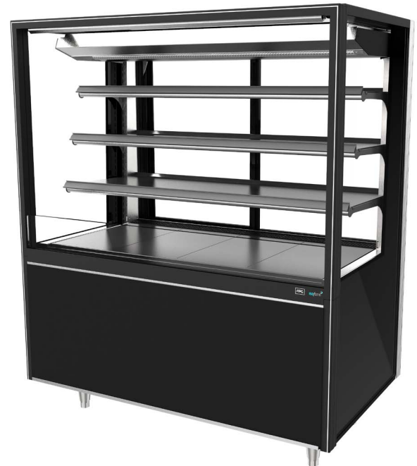
Showing : Isoform Counter refrigerated 1200mm freestanding open front