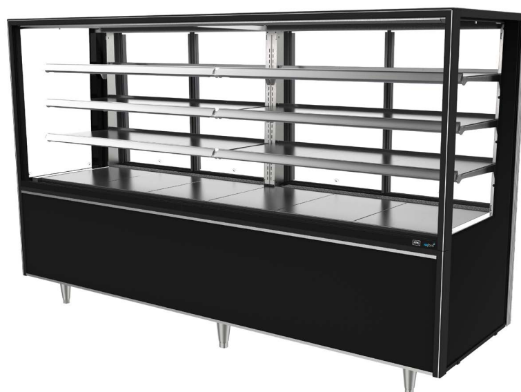
Showing : Isoform Counter heated 2400mm freestanding tilt front