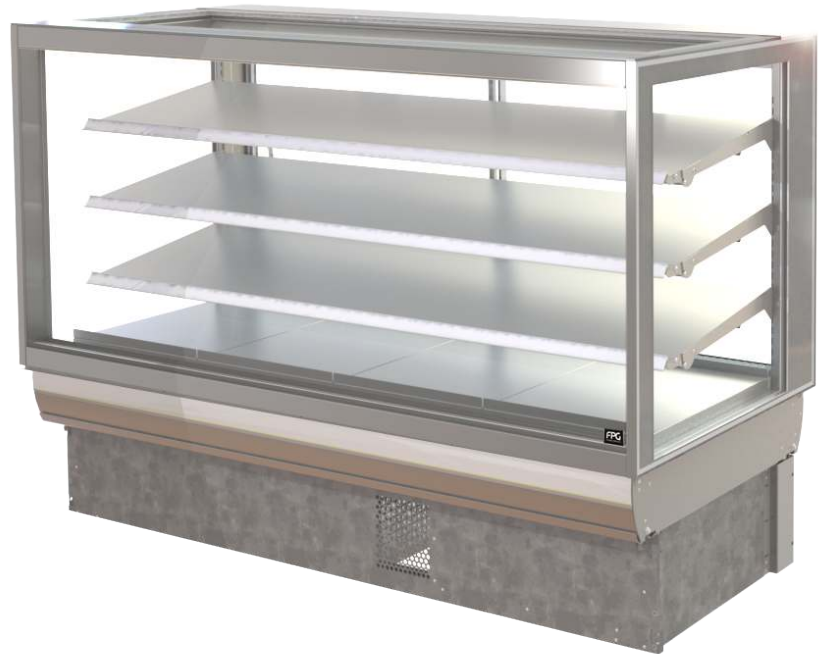
SHOWING : 4000 SERIES REFRIGERATED 1800mm SQUARE, WITH FIXED FRONT, IN COUNTER, WITH INTEGRAL CONDENSING UNIT