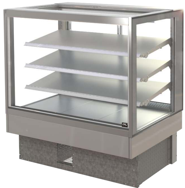
SHOWING : 4000 SERIES REFRIGERATED 1200mm SQUARE, WITH FIXED FRONT, ON COUNTER, WITH INTEGRAL CONDENSING UNIT