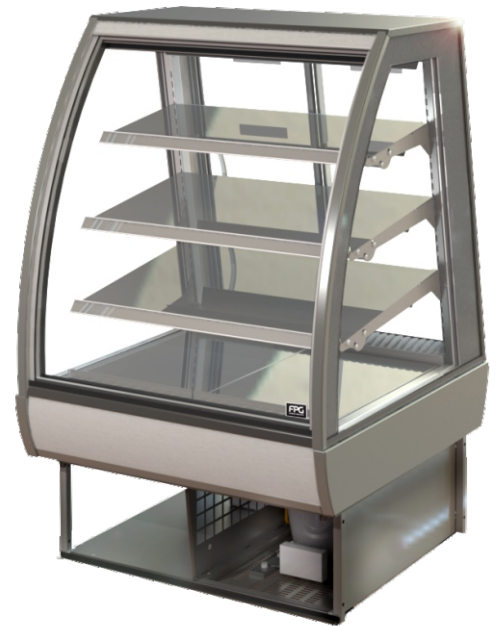
SHOWING : 4000 SERIES REFRIGERATED 800mm CURVED, WITH FIXED FRONT, ON COUNTER, WITH REMOTE CONDENSING UNIT