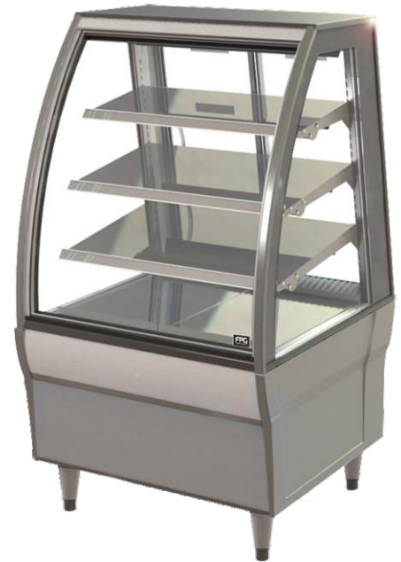
SHOWING : 4000 SERIES REFRIGERATED 800mm CURVED FREESTANDING, WITH FIXED FRONT, WITH INTEGRAL CONDENSING UNIT