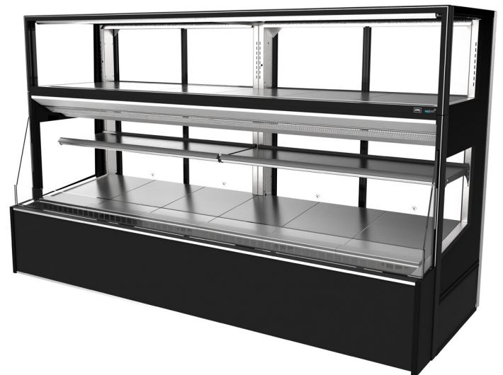
SHOWING: ISOFORM GRAB&GO, 2358mm WIDTH, 1454mm HEIGHT, ROLLERS TOP DISPLAY: REFRIGERATED, TILT FRONT BOTTOM DISPLAY: REFRIGERATED, OPEN FRONT, WITH SHELF

It's food and beverage display, re-imagined by you.