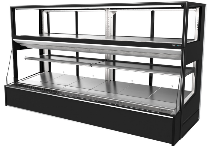
SHOWING : ISOFORM GRAB&GO, 2358mm WIDTH, 1354mm HEIGHT, ROLLERS TOP DISPLAY : REFRIGERATED, TILT FRONT BOTTOM DISPLAY : REFRIGERATED, OPEN FRONT

It's food and beverage display, re-imagined by you.