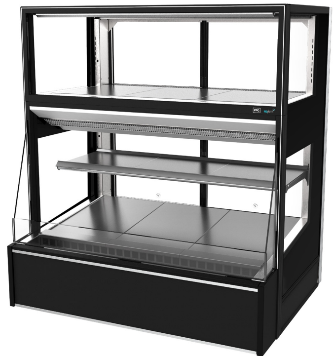
SHOWING : ISOFORM GRAB&GO, 1208mm WIDTH, 1354mm HEIGHT, ROLLERS TOP DISPLAY : REFRIGERATED, TILT FRONT BOTTOM DISPLAY : REFRIGERATED, OPEN FRONT, WITH SHELF