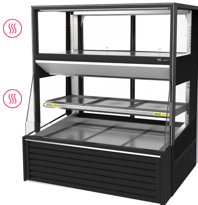
Showing : Isoform Grab&Go 1208mm width x 1454mm height Top Display: Heated, tilt front. Bottom Display: Heated, open front with IWave shelf