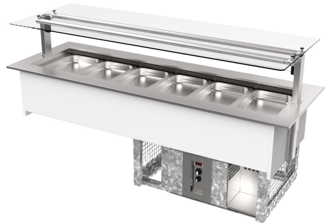
Showing : Inline GN Series refrigerated in-counter 6x 1/1 pans, fitted with flat self-serve gantry (option) and GN pans (accessories)