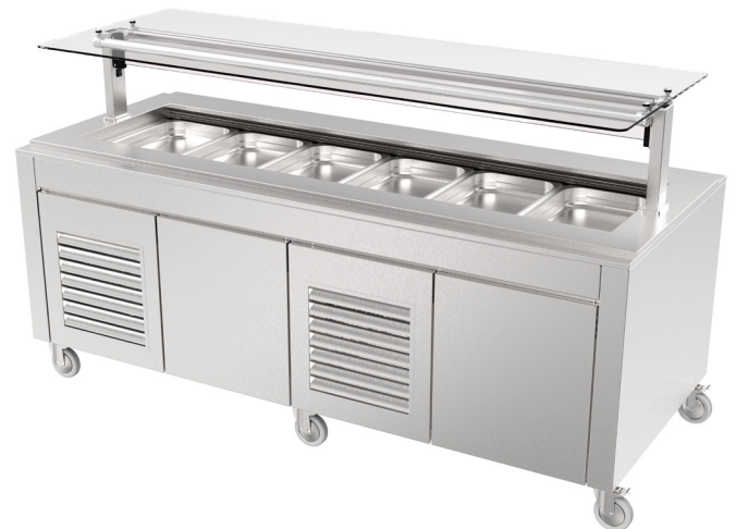
Showing : Inline GN Series Mobile refrigerated 6x 1/1 pans, fitted with flat self-serve gantry (option) and GN pans (accessories)