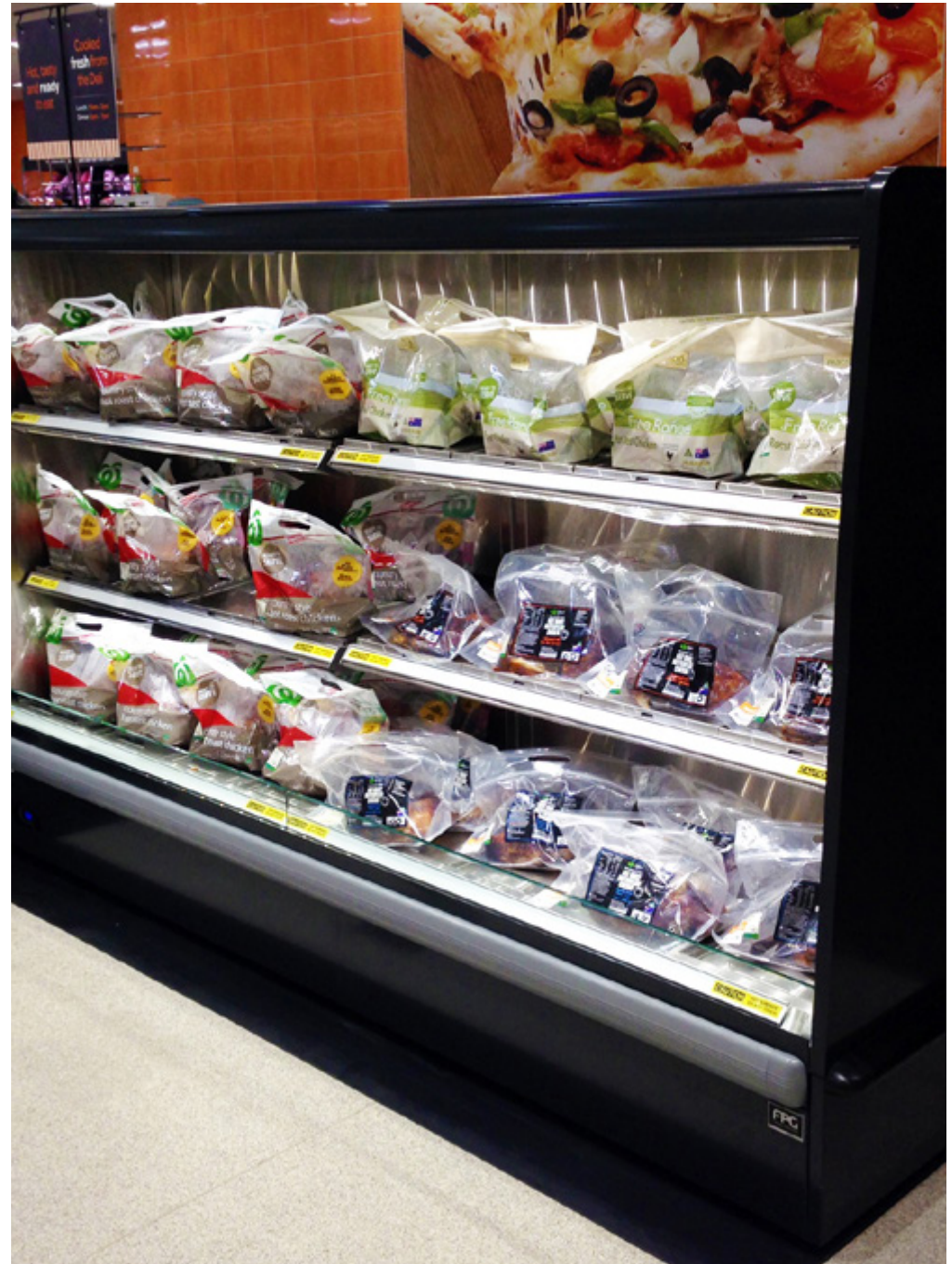
WOOLWORTHS SUPERMARKET, GREYSTANES, SYDNEY, AUSTRALIA - VISAIR UPRIGHT HEATED 2000

In the Visair heated cabinets, pluggable LED lighting is located at the top of the cabinet and at each shelf level. The plug-in feature enables the LED lighting to be replaced without the need for an electrician. With a lifetime of 25,000 hours, it will not need to be replaced very often!