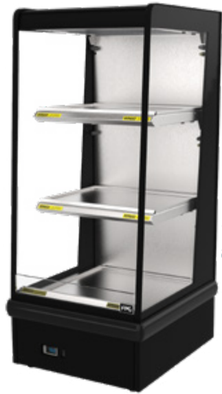
Standard height with 2 shelf levels + base