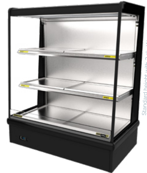
Standard height with 2 shelf levels + base