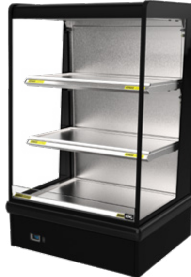
Standard height with 2 shelf levels + base