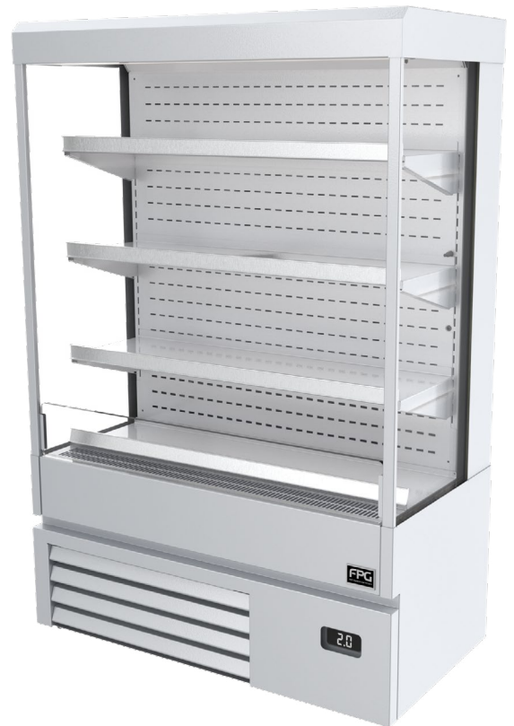
Showing : 7-Eleven Impulse Slim 13H 09W refrigerated Bright Silver freestanding open front with three shelves and base