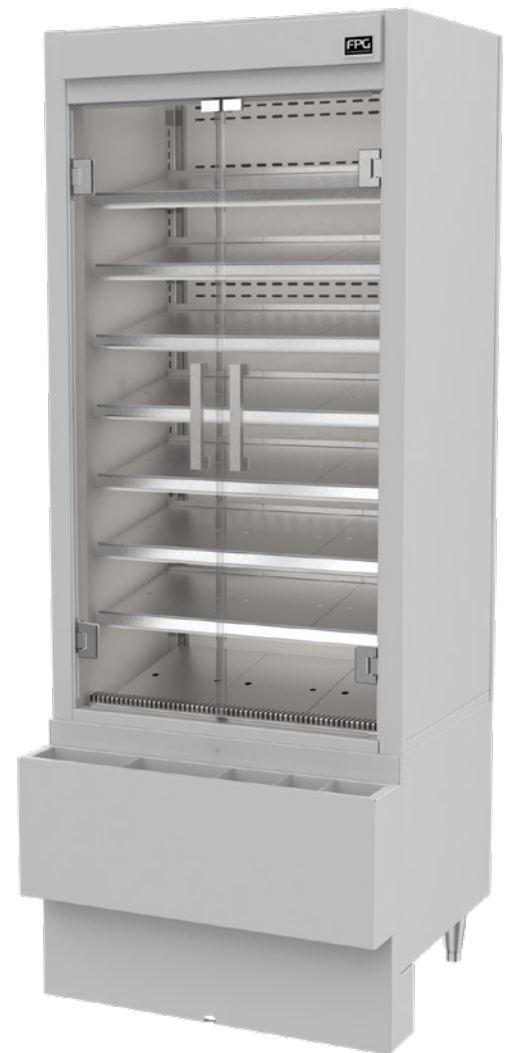
Showing : 7-Eleven Tower 800mm controlled ambient freestanding with swing doors, seven shelves and base. Fitted with condiments holder.