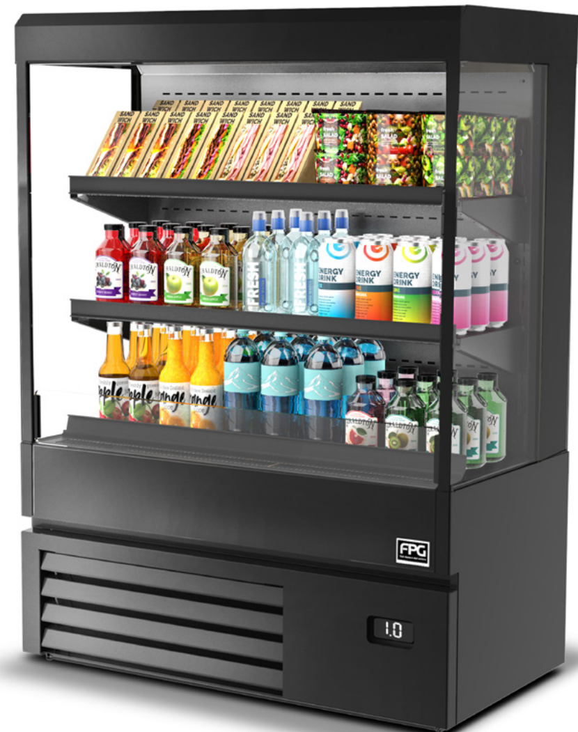
Impulse Slim Refrigerated 12H 09W