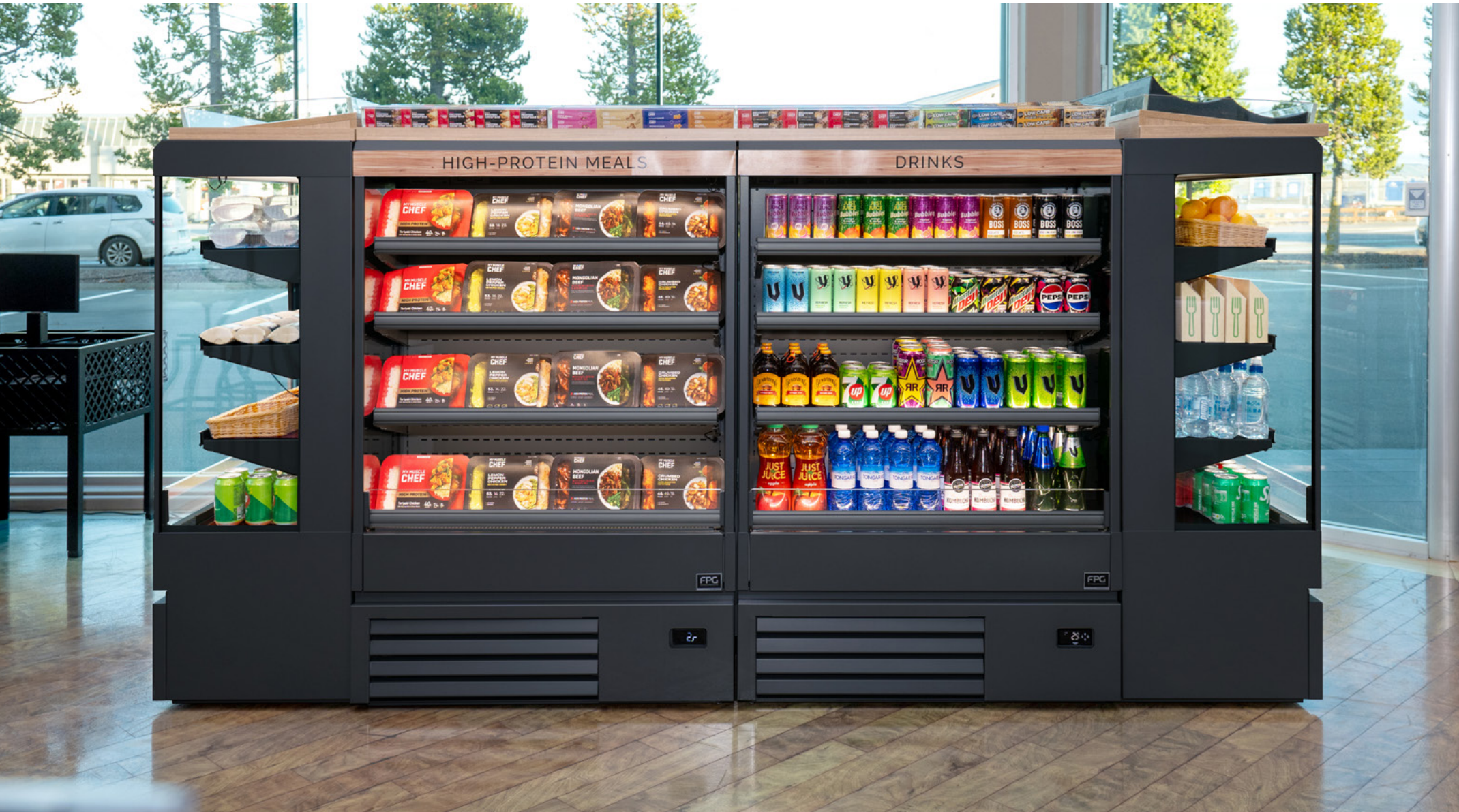
IMPULSE SLIM REFRIGERATED 13H 09W - 6-CABINET ISLAND CONFIGURATION WITH 3 SHELVES PLUS BASE AND AMBIENT DISPLAY TO TOP