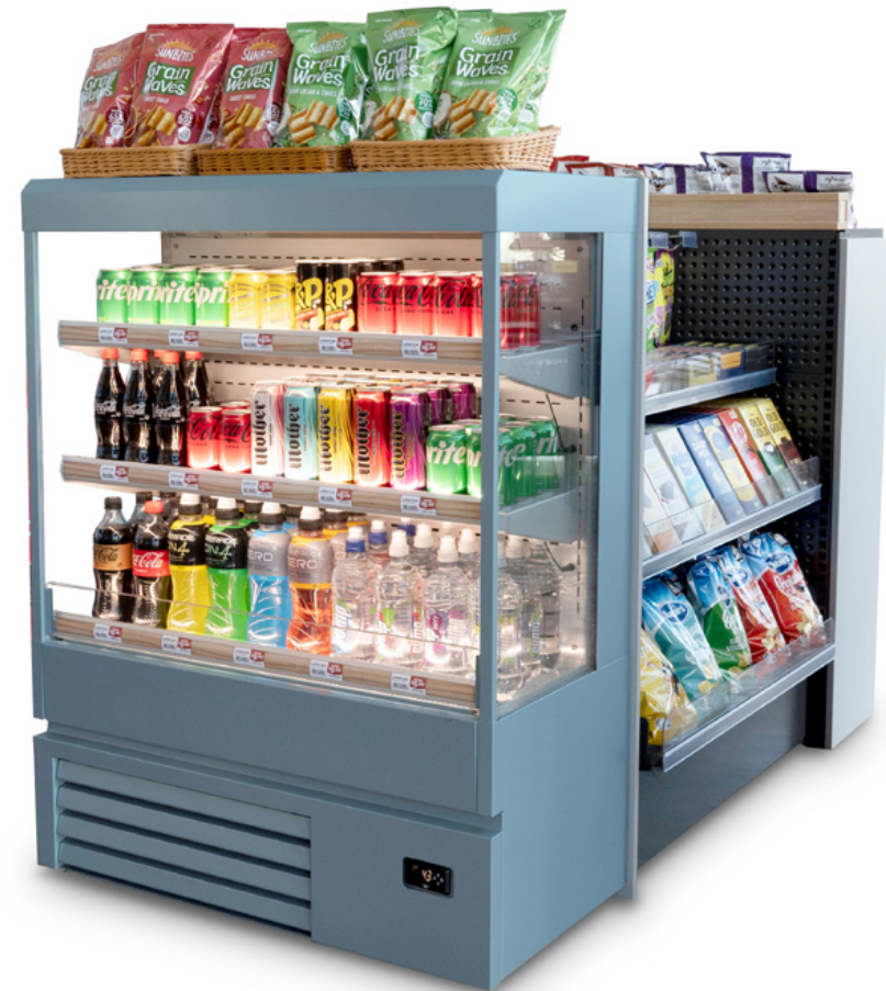
Impulse Slim Refrigerated 12H 09W gondola end with ambient island.

Talk to us. FPG can design and build your integrated display.