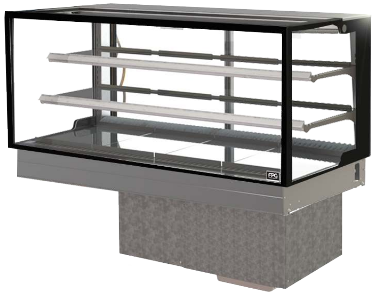
SHOWING : 3000 SERIES CONTROLLED AMBIENT 1500mm SQUARE, WITH FIXED FRONT, IN COUNTER, WITH INTEGRAL CONDENSING UNIT