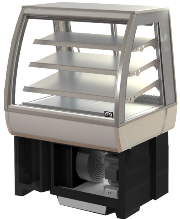
SHOWING : 3000 SERIES CONTROLLED AMBIENT 800m CURVED, WITH FIXED FRONT, ON COUNTER, WITH INTEGRAL CONDENSING UNIT