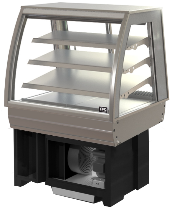
SHOWING : 3000 SERIES CONTROLLED AMBIENT 800m CURVED, WITH FIXED FRONT, IN COUNTER, WITH INTEGRAL CONDENSING UNIT