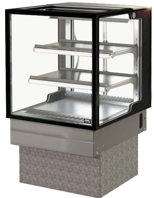
SHOWING : 3000 SERIES CONTROLLED AMBIENT 600mm SQUARE, WITH FIXED FRONT, IN COUNTER, WITH INTEGRAL CONDENSING UNIT