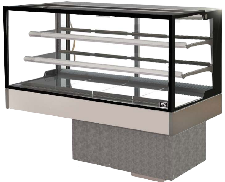
SHOWING : 3000 SERIES REFRIGERATED 1500mm SQUARE, WITH FIXED FRONT, ON COUNTER, WITH INTEGRAL CONDENSING UNIT