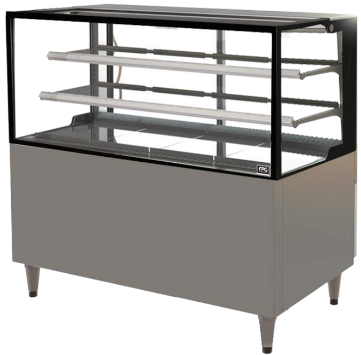
SHOWING : 3000 SERIES REFRIGERATED 1500mm SQUARE FREESTANDING, WITH FIXED FRONT, WITH INTEGRAL CONDENSING UNIT