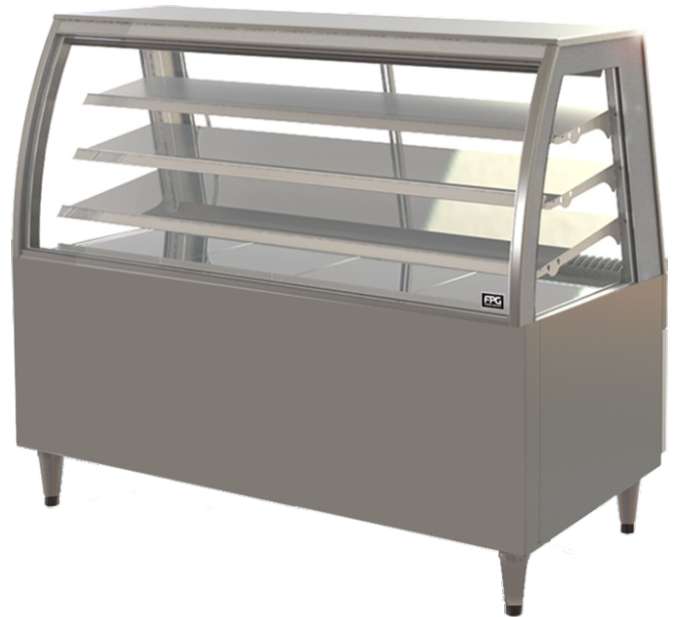
SHOWING : 3000 SERIES REFRIGERATED 1500mm CURVED FREESTANDING, WITH FIXED FRONT, WITH INTEGRAL CONDENSING UNIT